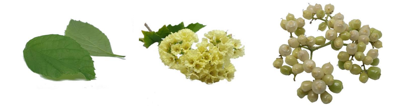
From left to right: Leaves, flowers and fruits of Cordia dentata.

General care: Cordia dentata needs little care. Water the tree regularly at first until the roots are well developed.