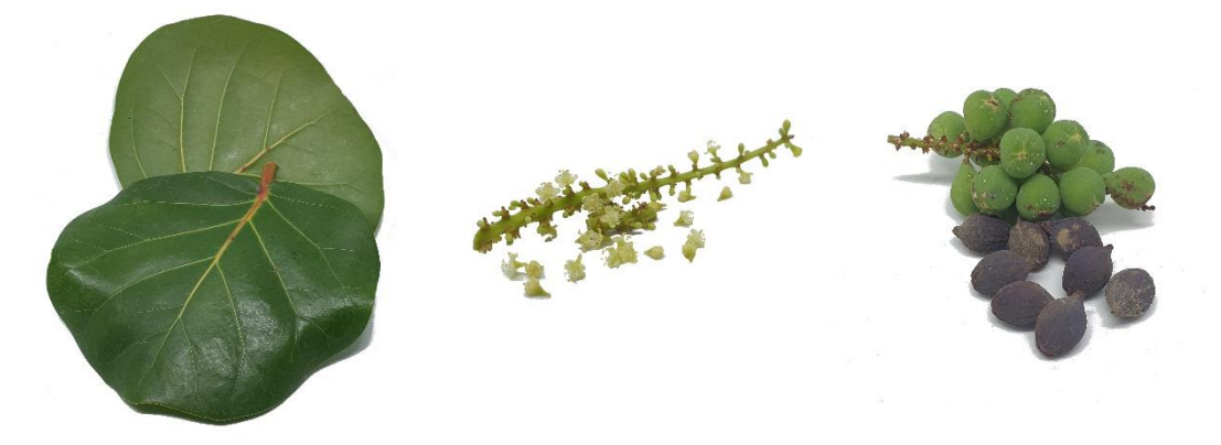
From left to right: Leaves, flowers and fruits of Coccoloba uvifera.

General care: Coccoloba uvifera requires little care. Water the tree regularly after planting so that the roots develop well.