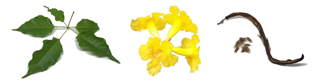
From left to right: Leaves, flowers and seedpod of Handroanthus billbergii.

General care: Handroanthus billbergii is an easy tree that can withstand the dry period. Water the tree regularly at first until the roots are well developed.