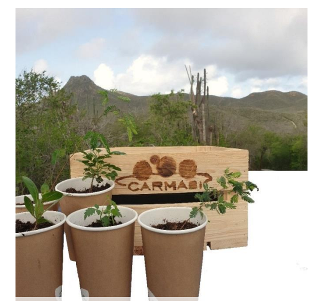
View of the Christoffelberg, as seen from the ruins of Zorgvlied in het Christoffelpark.