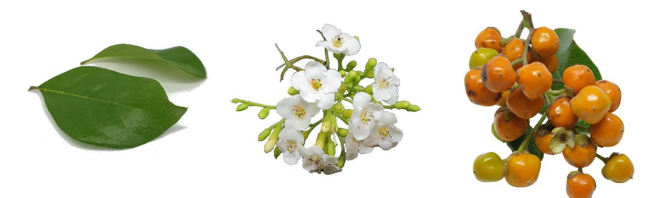
From left to right: Leaves, flowers and fruits of Bourreria succulenta.

General care: Bourreria succulenta is very resistant to heat and requires little care. Water the tree regularly at first until the roots are well developed.