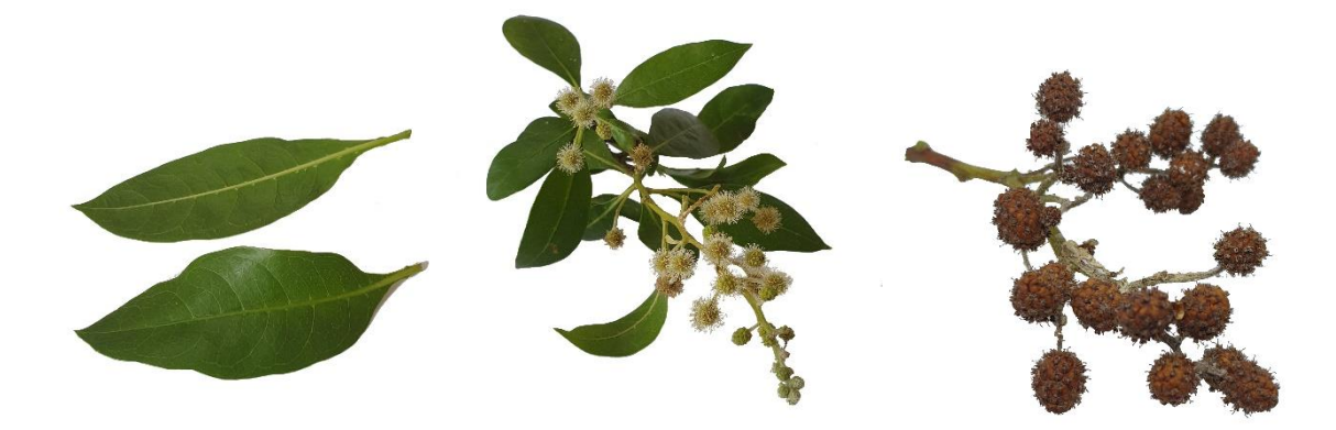
From left to right: Leaves, flowers and fruits of Conocarpus erectus.

General care: Conocarpus erectus grows into a tree with a beautiful crown, but also can be pruned into a hedge. Although this tree can withstand drought, watering is recommended during extreme droughts and will improve growth.