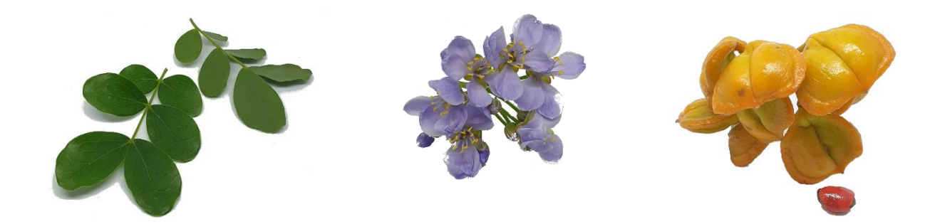
From left to right: Leaves, flowers and fruits of Guaiacum officinale.

General care: Guaiacum officinale requires little maintenance and can be pruned well. Unpruned, the plant will grow into a tree with a beautiful crown.